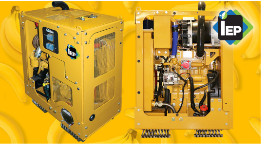
Auxiliary Power Unit